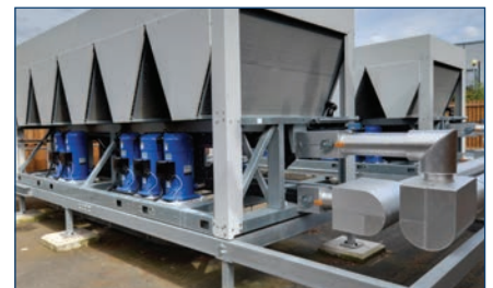
Free Cooling Water Chillers