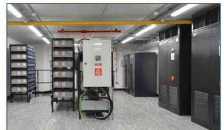
Close Control Air Conditioning