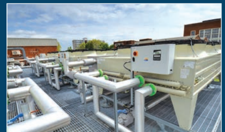
External Dry Air Coolers