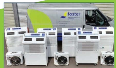
Temporary Air Conditioning units for hire